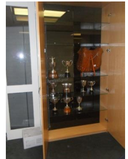
The new trophy cabinet in the CNZ Office

After the formalities of each event have concluded the trophies will come back to the CNZ Office for permanent display. A new Trophy Cabinet has been fitted at the CNZ offices especially for that purpose. CNZ will be responsible for all engraving and transporting costs.