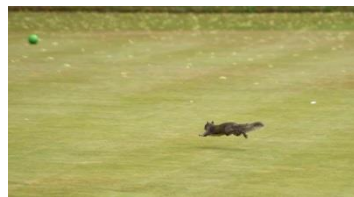
After the play – it is the squirrel’s turn

Commentary and scores are available on the website www.croquetscores.com