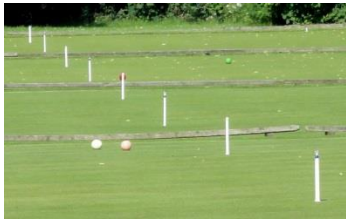
8 lawns at Nottingham make for military regimentation in lawn settings.

We report on the World Women’s Association Croquet championships at Nottingham.