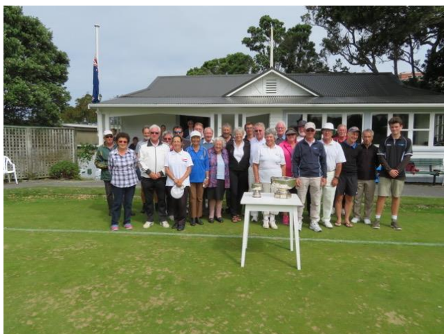
Arthur Ross Memorial Handicap Singles Final