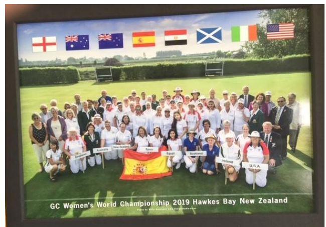
GC Women's World Championship 2019 Hawke's Bay